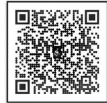
Scan the code to connect to our website