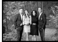
The Vescio Family