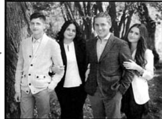
Vescio Family Serving Your Family